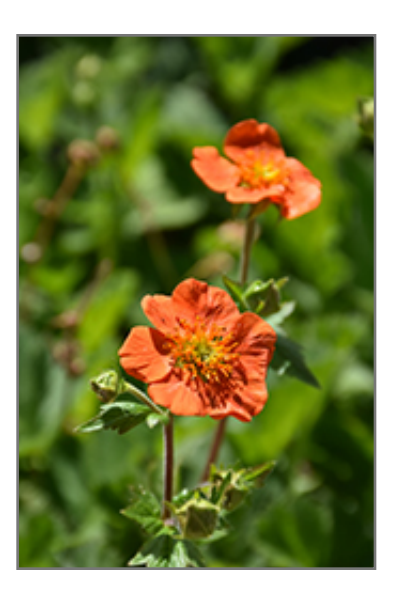
Cooky Avens flowers

Luminous, cup shaped flowers that are bright orange in color and brilliant in the sun; blooms throughout the summer over medium green, toothed foliage; stunning in borders and perennial beds