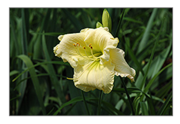
Cool It Daylily flowers