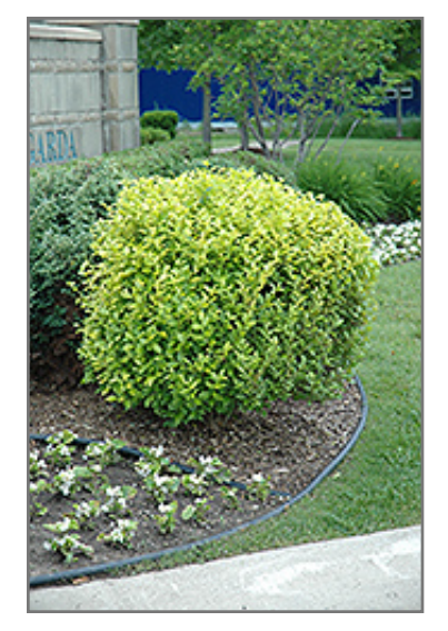
Golden Privet

This shrub will require occasional maintenance and upkeep, and can be pruned at anytime. It has no significant negative characteristics.