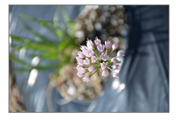
In Orbit Ornamental Onion flowers