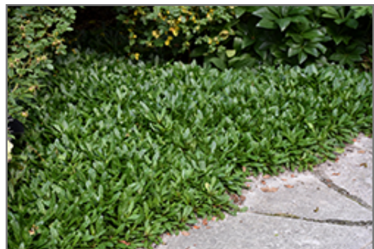
Emerald Chip Bugleweed