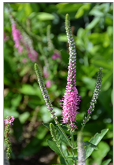
Perfectly Picasso Speedwell flowers