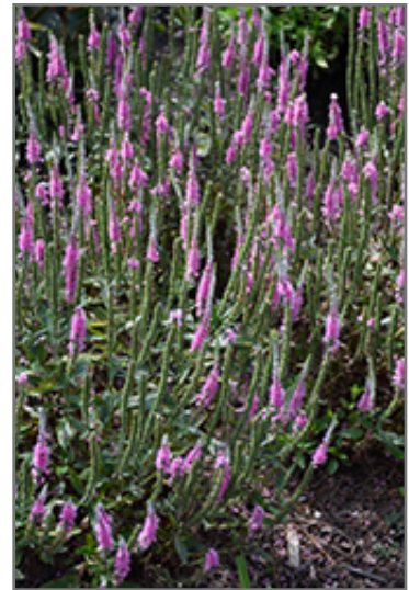
Perfectly Picasso Speedwell in bloom

Perfectly Picasso Speedwell is recommended for the following landscape applications;