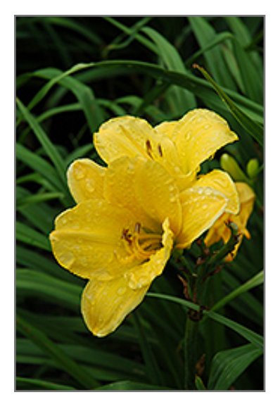
Chicago Full Moon Daylily flowers

Bright sunshine yellow flowers bloom during the early to mid summer months; tall flower stalks rise above mounds of green arching foliage; an cheery addition to borders, beds and containers; low maintenance and drought tolerant