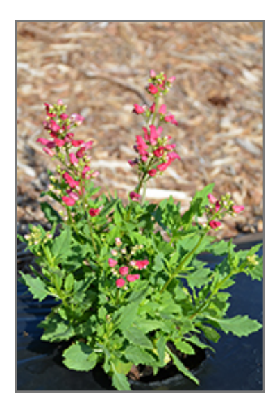
Cardinale Red Red Birds In A Tree in bloom