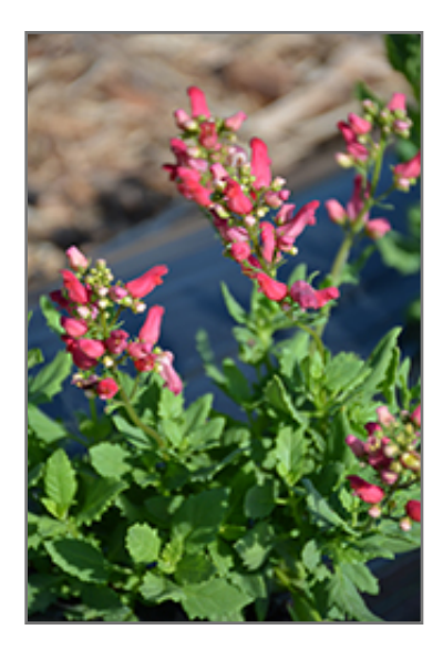
Cardinale Red Red Birds In A Tree flowers