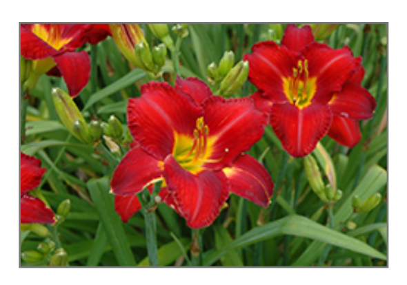
Chicago Apache Daylily flowers