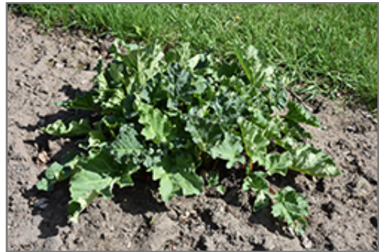
Victoria Rhubarb

Victoria Rhubarb features bold spikes of white flowers rising above the foliage from early to mid summer. Its enormous crinkled heart-shaped leaves remain green in colour throughout the season. The cherry red stems are very colorful and add to the overall interest of the plant.