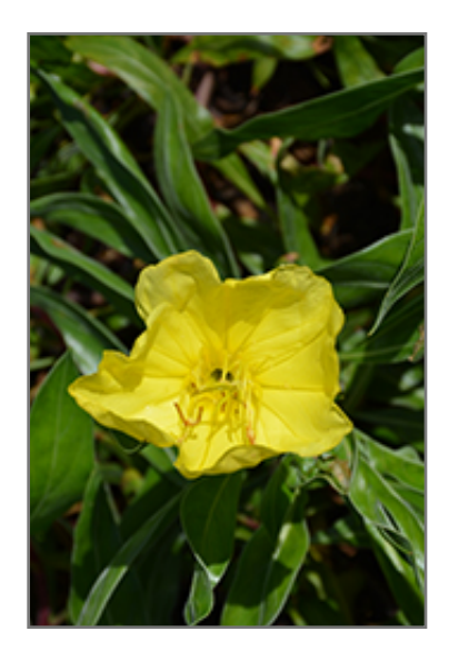
Ozark Sundrops flowers

A vigorous trailing plant with lance shaped green foliage with white midribs; sunny yellow, cup shaped flowers bloom over a long season; seed pods can be dried for floral arrangements; perfect for rock gardens or border fronts