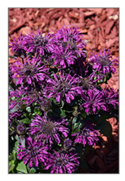
Rockin' Raspberry Beebalm flowers