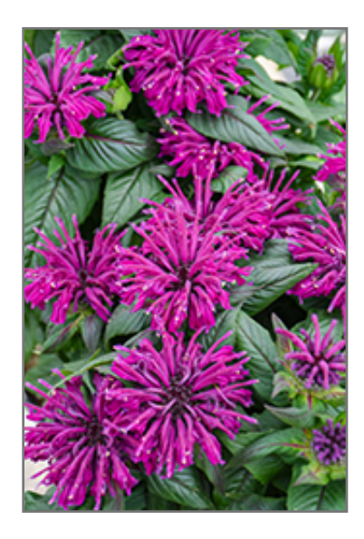
Rockin' Raspberry Beebalm flowers

This plant will require occasional maintenance and upkeep, and should be cut back in late fall in preparation for winter. It is a good choice for attracting bees, butterflies and hummingbirds to your yard, but is not particularly attractive to deer who tend to leave it alone in favor of tastier treats. Gardeners should be aware of the following characteristic(s) that may warrant special consideration;