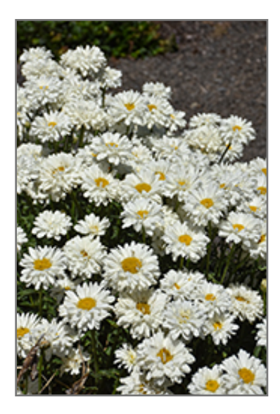
Victorian Secret Shasta Daisy flowers

Victorian Secret Shasta Daisy is recommended for the following landscape applications;