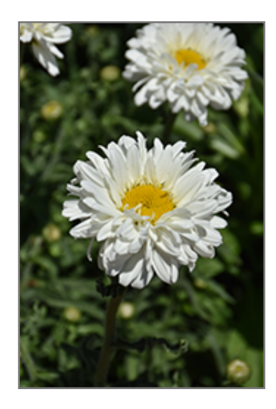
Victorian Secret Shasta Daisy flowers