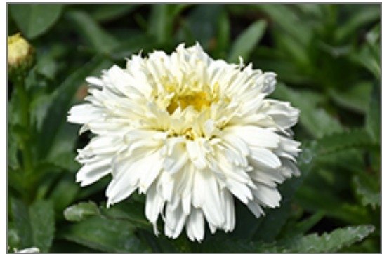
Macaroon Shasta Daisy flowers