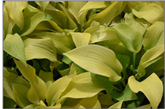
Prairie Moon Hosta foliage

Prairie Moon Hosta is recommended for the following landscape applications;