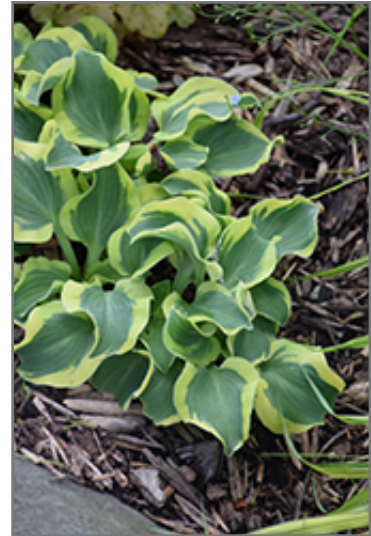
Mini Skirt Hosta

Mini Skirt Hosta is recommended for the following landscape applications;