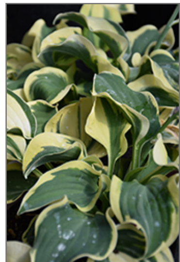
Mini Skirt Hosta foliage