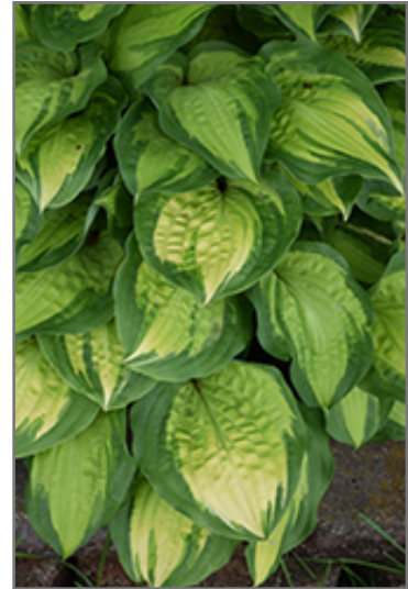
Island Breeze Hosta foliage