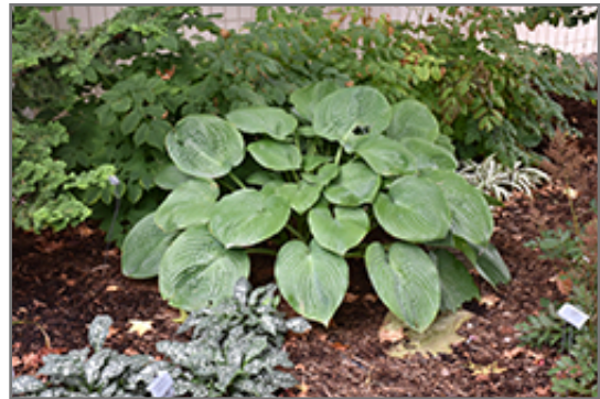
Humpback Whale Hosta

Humpback Whale Hosta is recommended for the following landscape applications;