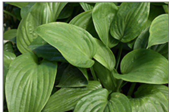
Humpback Whale Hosta foliage