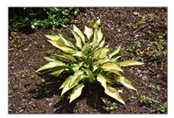
Happy Dayz Hosta

This is a relatively low maintenance plant, and is best cleaned up in early spring before it resumes active growth for the season. Gardeners should be aware of the following characteristic(s) that may warrant special consideration;