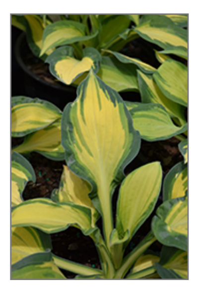
Happy Dayz Hosta foliage

Happy Dayz Hosta is a dense herbaceous perennial with tall flower stalks held atop a low mound of foliage. Its medium texture blends into the garden, but can always be balanced by a couple of finer or coarser plants for an effective composition.