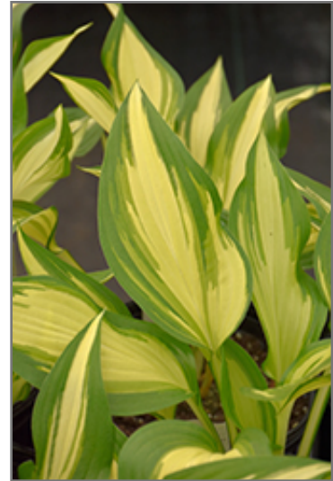
Cool As A Cucumber Hosta foliage