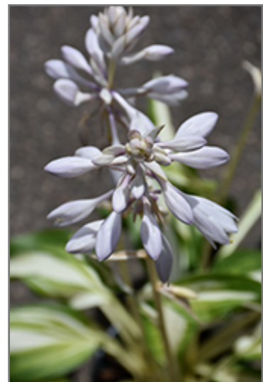
Cool As A Cucumber Hosta flowers