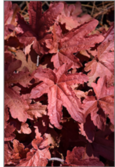
Fun and Games Red Rover Foamy Bells foliage

This is a relatively low maintenance plant, and should be cut back in late fall in preparation for winter. It is a good choice for attracting hummingbirds to your yard. It has no significant negative characteristics.