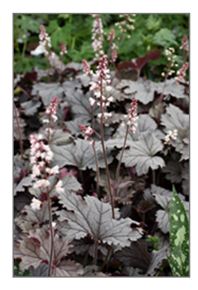
Plum Cascade Foamy Bells flowers

This is a relatively low maintenance plant, and should be cut back in late fall in preparation for winter. It is a good choice for attracting hummingbirds to your yard. It has no significant negative characteristics.