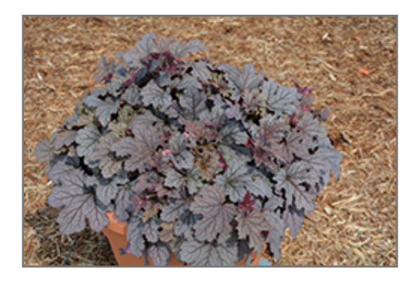
Plum Cascade Foamy Bells