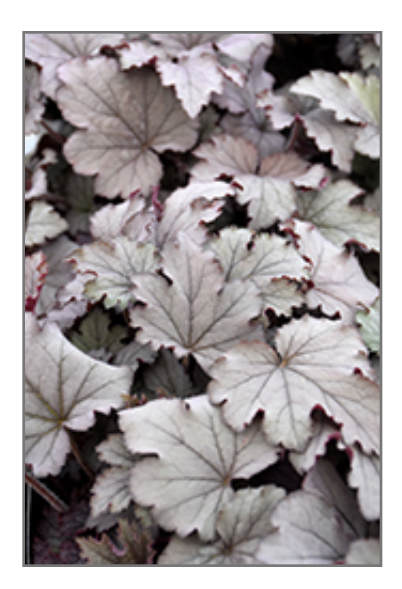
Plum Cascade Foamy Bells foliage

Plum Cascade Foamy Bells will grow to be about 9 inches tall at maturity extending to 12 inches tall with the flowers, with a spread of 32 inches. When grown in masses or used as a bedding plant, individual plants should be spaced approximately 28 inches apart. Its foliage tends to remain low and dense right to the ground. It grows at a medium rate, and under ideal conditions can be expected to live for approximately 10 years. As an evegreen perennial, this plant will typically keep its form and foliage year-round.