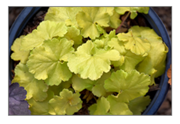
Northern Exposure Lime Coral Bells foliage

Northern Exposure Lime Coral Bells is primarily valued in the garden for its distinctive form, with the flower stalks towering over the foliage. It features dainty spikes of antique red bell-shaped flowers rising above the foliage from late spring to early summer. Its attractive crinkled round leaves emerge lemon yellow in spring, turning lime green in colour the rest of the year.