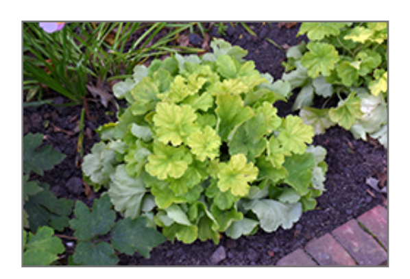
Northern Exposure Lime Coral Bells