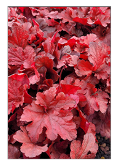
Forever Red Coral Bells foliage

Forever Red Coral Bells is recommended for the following landscape applications;