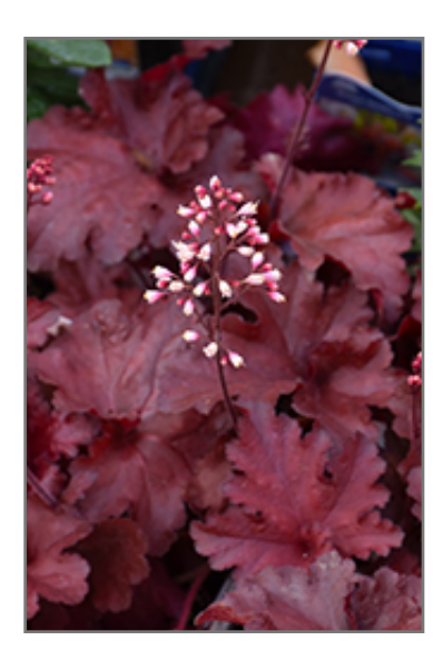
Forever Red Coral Bells flowers