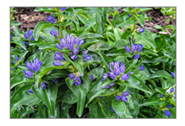
Blue Cross Gentian flowers