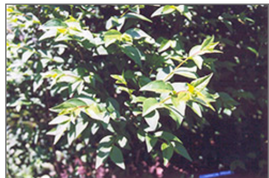
Common Privet foliage