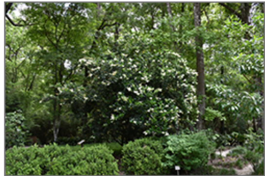
Common Privet in bloom