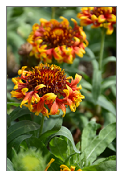
Sun Devil Blanket Flower flowers

Sun Devil Blanket Flower is recommended for the following landscape applications;