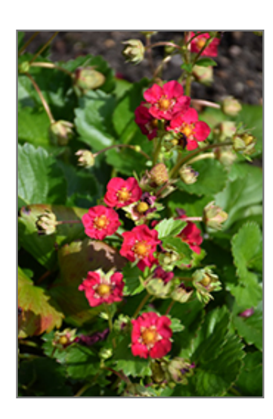
Ruby Ann Strawberry flowers

Ruby Ann Strawberry features showy ruby-red cup-shaped flowers with lemon yellow eyes along the stems from early to late summer. Its serrated round compound leaves remain forest green in colour throughout the season. It features an abundance of magnificent red berries from early to late summer.