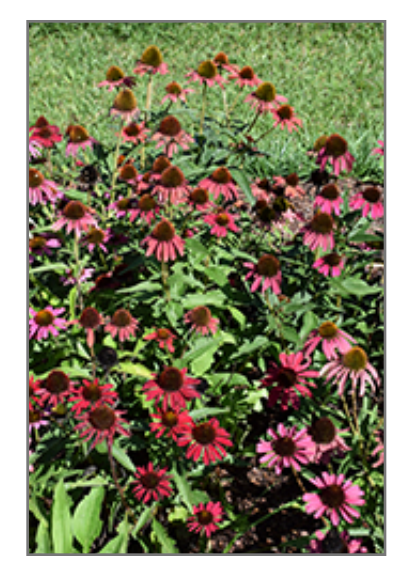
Glowing Dream Coneflower in bloom