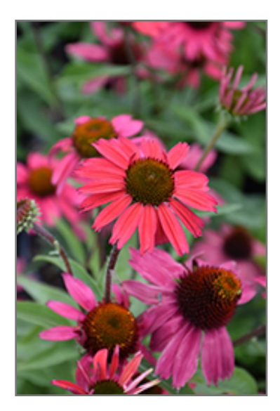
Glowing Dream Coneflower flowers

Glowing Dream Coneflower is recommended for the following landscape applications;