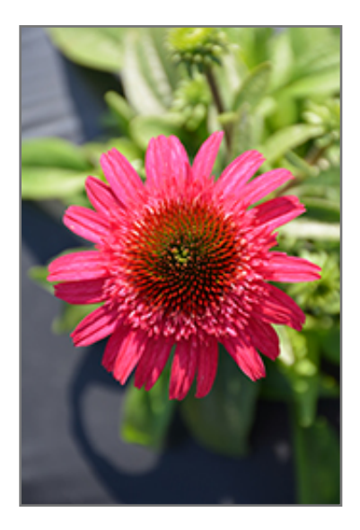
Cara Mia Rose Coneflower flowers