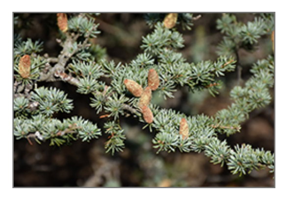
Brevifolia Cedar of Lebanon foliage

The Brevifolia Cedar of Lebanon is recommended for the following landscape applications;