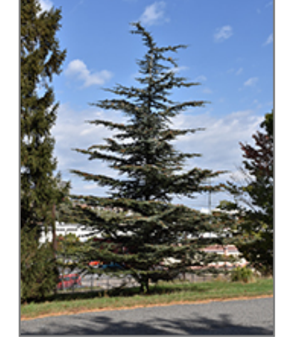
Brevifolia Cedar of Lebanon

This is a relatively low maintenance tree, and usually looks its best without pruning, although it will tolerate pruning. It has no significant negative characteristics.