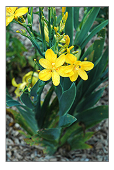
Hello Yellow Blackberry Lily flowers

Tall spikes topped with cheerful, lemon-yellow flowers followed by blackberry-like seed pods in summer; breathtaking when planted in masses; sword-like foliage resembles that of an iris