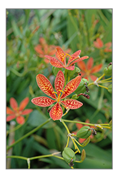
Blackberry Lily flowers

Blackberry Lily is recommended for the following landscape applications;