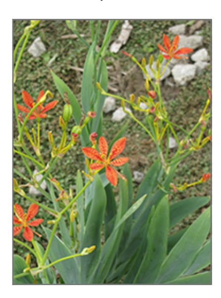
Blackberry Lily flowers