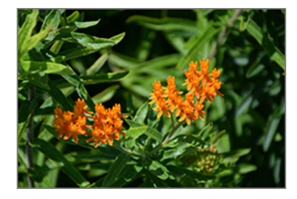
Butterfly Weed flowers