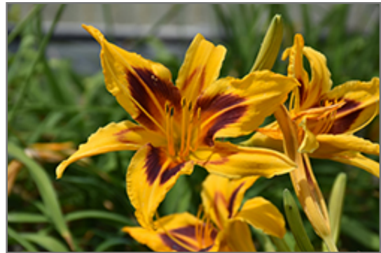
Bonanza Daylily flowers

Rich golden yellow flowers with burgundy eyes and lightly ruffled edges bloom early in the season; heat and drought tolerant, great for borders, beds and containers; a low maintenance, reliable rebloomer