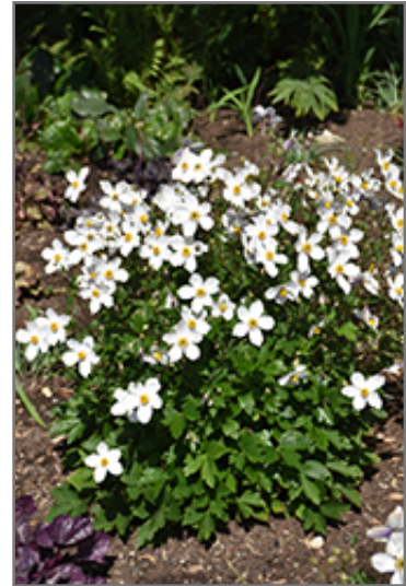
Wild Swan Anemone in bloom

This plant does best in full sun to partial shade. It prefers to grow in average to moist conditions, and shouldn't be allowed to dry out. It is not particular as to soil type or pH. It is somewhat tolerant of urban pollution. This particular variety is an interspecific hybrid. It can be propagated by division; however, as a cultivated variety, be aware that it may be subject to certain restrictions or prohibitions on propagation.