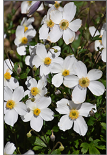
Wild Swan Anemone flowers