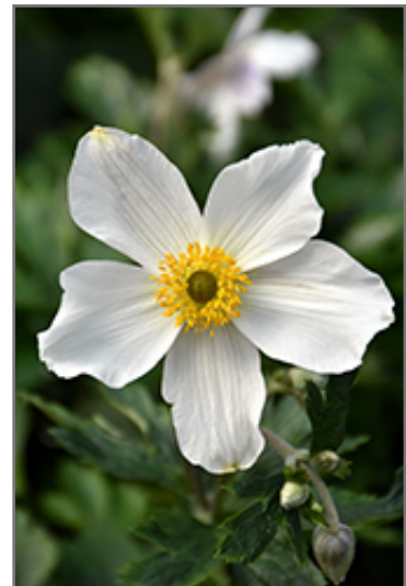
Wild Swan Anemone flowers