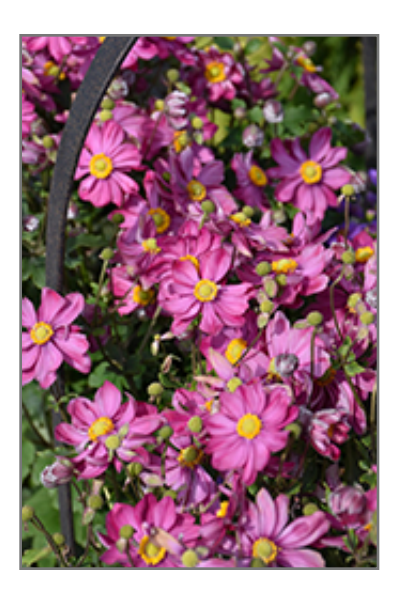
Curtain Call Deep Rose Anemone flowers

Curtain Call Deep Rose Anemone is a fine choice for the garden, but it is also a good selection for planting in outdoor pots and containers. It is often used as a 'filler' in the 'spiller-thriller-filler' container combination, providing a mass of flowers against which the larger thriller plants stand out. Note that when growing plants in outdoor containers and baskets, they may require more frequent waterings than they would in the yard or garden. Be aware that in our climate, most plants cannot be expected to survive the winter if left in containers outdoors, and this plant is no exception. Contact our experts for more information on how to protect it over the winter months.