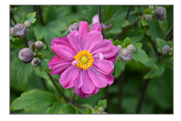
Curtain Call Deep Rose Anemone flowers

Curtain Call Deep Rose Anemone is a dense herbaceous perennial with an upright spreading habit of growth. Its relatively fine texture sets it apart from other garden plants with less refined foliage.