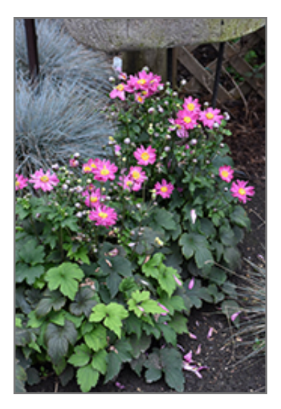
Curtain Call Deep Rose Anemone in bloom