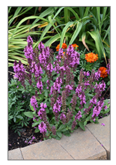
Rose Marvel Meadow Sage in bloom

Rose Marvel Meadow Sage is a fine choice for the garden, but it is also a good selection for planting in outdoor pots and containers. It is often used as a 'filler' in the 'spiller-thriller-filler' container combination, providing a mass of flowers against which the larger thriller plants stand out. Note that when growing plants in outdoor containers and baskets, they may require more frequent waterings than they would in the yard or garden. Be aware that in our climate, most plants cannot be expected to survive the winter if left in containers outdoors, and this plant is no exception. Contact our experts for more information on how to protect it over the winter months.