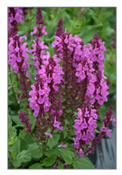
Rose Marvel Meadow Sage flowers