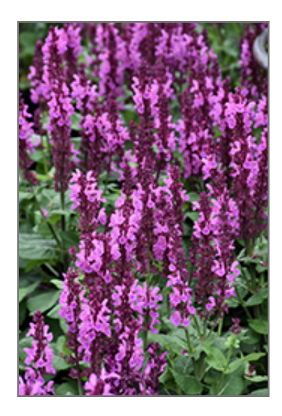
Rose Marvel Meadow Sage flowers

This is a relatively low maintenance plant, and is best cleaned up in early spring before it resumes active growth for the season. It is a good choice for attracting butterflies and hummingbirds to your yard, but is not particularly attractive to deer who tend to leave it alone in favor of tastier treats. It has no significant negative characteristics.