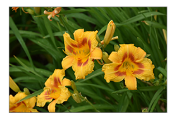
Black Eyed Stella Daylily flowers