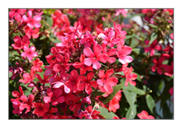
Early Red Garden Phlox flowers