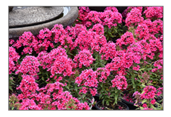
Early Red Garden Phlox flowers

Early Red Garden Phlox is recommended for the following landscape applications;