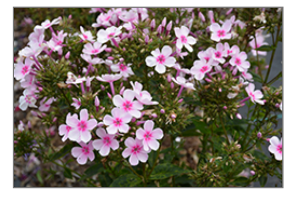
Early Start Light Pink Garden Phlox flowers