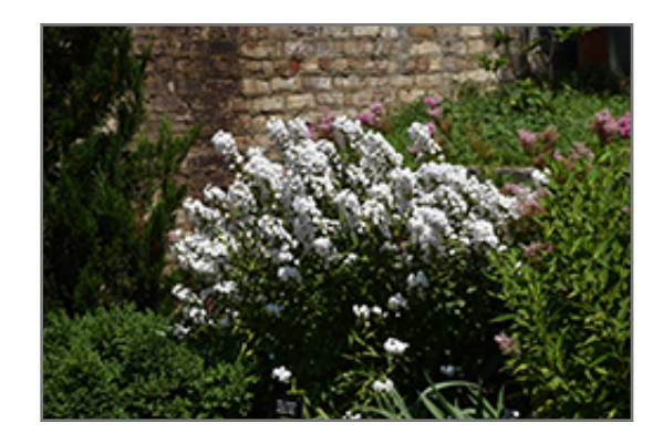
Flower Power Meadow Phlox in bloom

Flower Power Meadow Phlox is recommended for the following landscape applications;