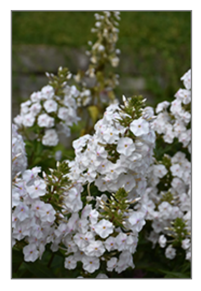
Flower Power Meadow Phlox flowers

This is a relatively low maintenance plant, and should be cut back in late fall in preparation for winter. It is a good choice for attracting butterflies and hummingbirds to your yard, but is not particularly attractive to deer who tend to leave it alone in favor of tastier treats. It has no significant negative characteristics.