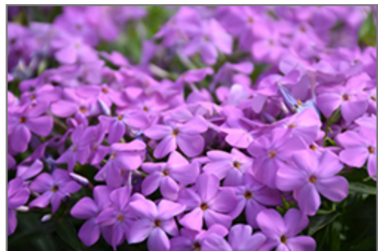
Forever Pink Garden Phlox flowers