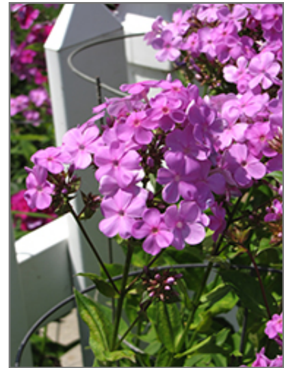
Forever Pink Garden Phlox flowers