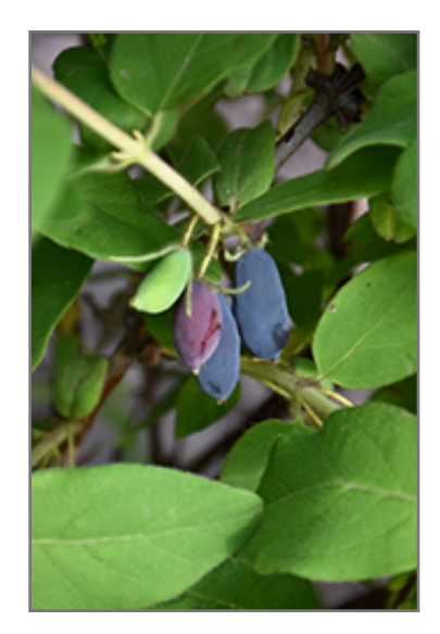
Aurora Honeyberry fruit

Aurora Honeyberry features subtle yellow flowers along the branches in early spring. It has green deciduous foliage. The narrow leaves do not develop any appreciable fall colour. It features an abundance of magnificent blue berries in late spring.