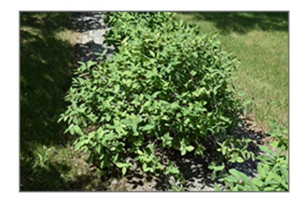
Aurora Honeyberry