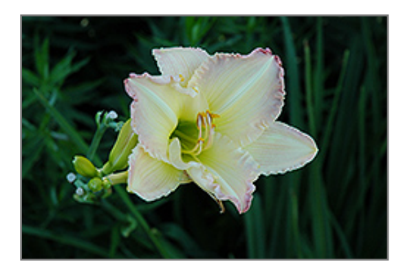
Beautiful Edgings Daylily flowers