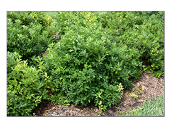
Little Goblin Guy Winterberry

This selection is the recommended pollinator for Little Goblin Red and Little Goblin Orange; plays a role in getting the best from these varieties; great in particularly wet sites, needs acidic soil