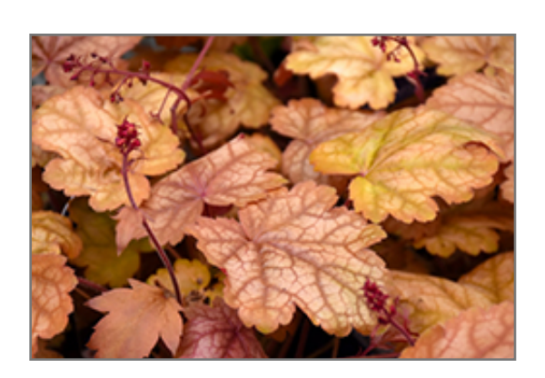
Vulcano Coral Bells foliage

Vulcano Coral Bells is recommended for the following landscape applications;