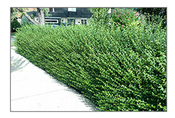
Amur Privet