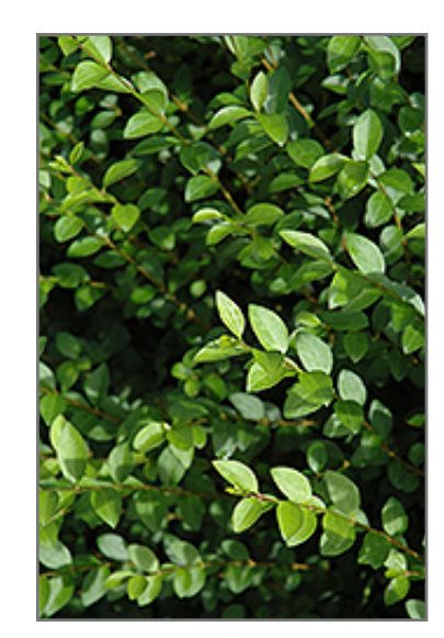
Amur Privet foliage

Amur Privet is recommended for the following landscape applications;