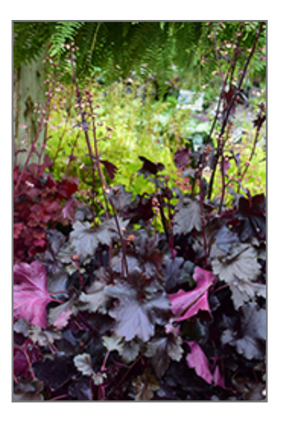
Black Pearl Coral Bells in bloom

This is a relatively low maintenance plant, and should be cut back in late fall in preparation for winter. It is a good choice for attracting hummingbirds to your yard. It has no significant negative characteristics.