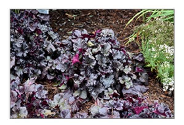
Black Pearl Coral Bells

Black Pearl Coral Bells will grow to be about 10 inches tall at maturity extending to 20 inches tall with the flowers, with a spread of 26 inches. When grown in masses or used as a bedding plant, individual plants should be spaced approximately 20 inches apart. Its foliage tends to remain low and dense right to the ground. It grows at a medium rate, and under ideal conditions can be expected to live for approximately 10 years. As an evegreen perennial, this plant will typically keep its form and foliage year-round.