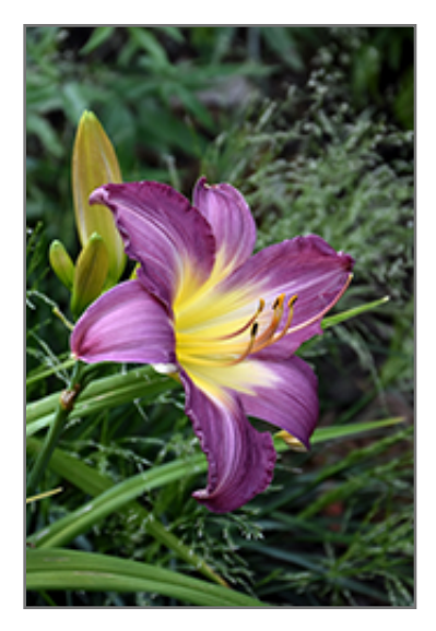
Swirling Water Daylily flowers